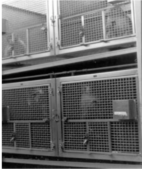
Figure 4. The two-tiered caging system still used today in some laboratories shows that there are large differences in lighting in the top and bottom cage. (Reinhardt, 2001).

Please direct all correspondence to: Amy Kerwin respectrhesus@charter.net 608.220.2166