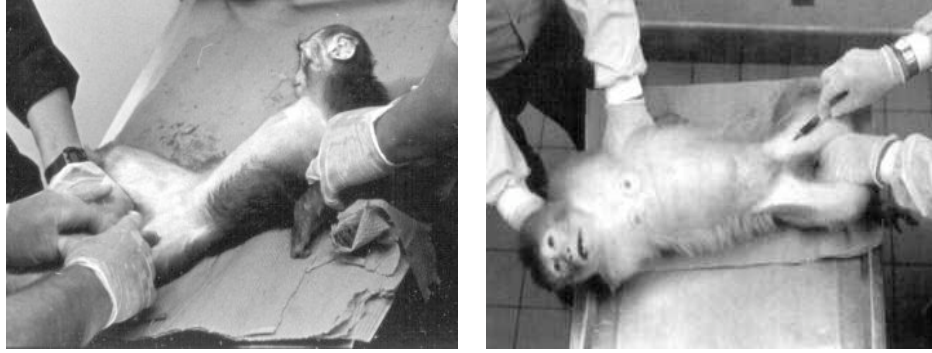
Figure 1. Routine handling of a juvenile rhesus monkey (left) and an adult monkey (right) for obtaining blood. In the laboratory, leather gloves were used to catch and restrain the monkey, thereby adding an additional stressor. (Reinhardt, 2001; Reinhardt and Reinhardt, 2003).